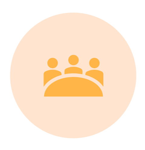
MONITORING PROGRAM REVIEW