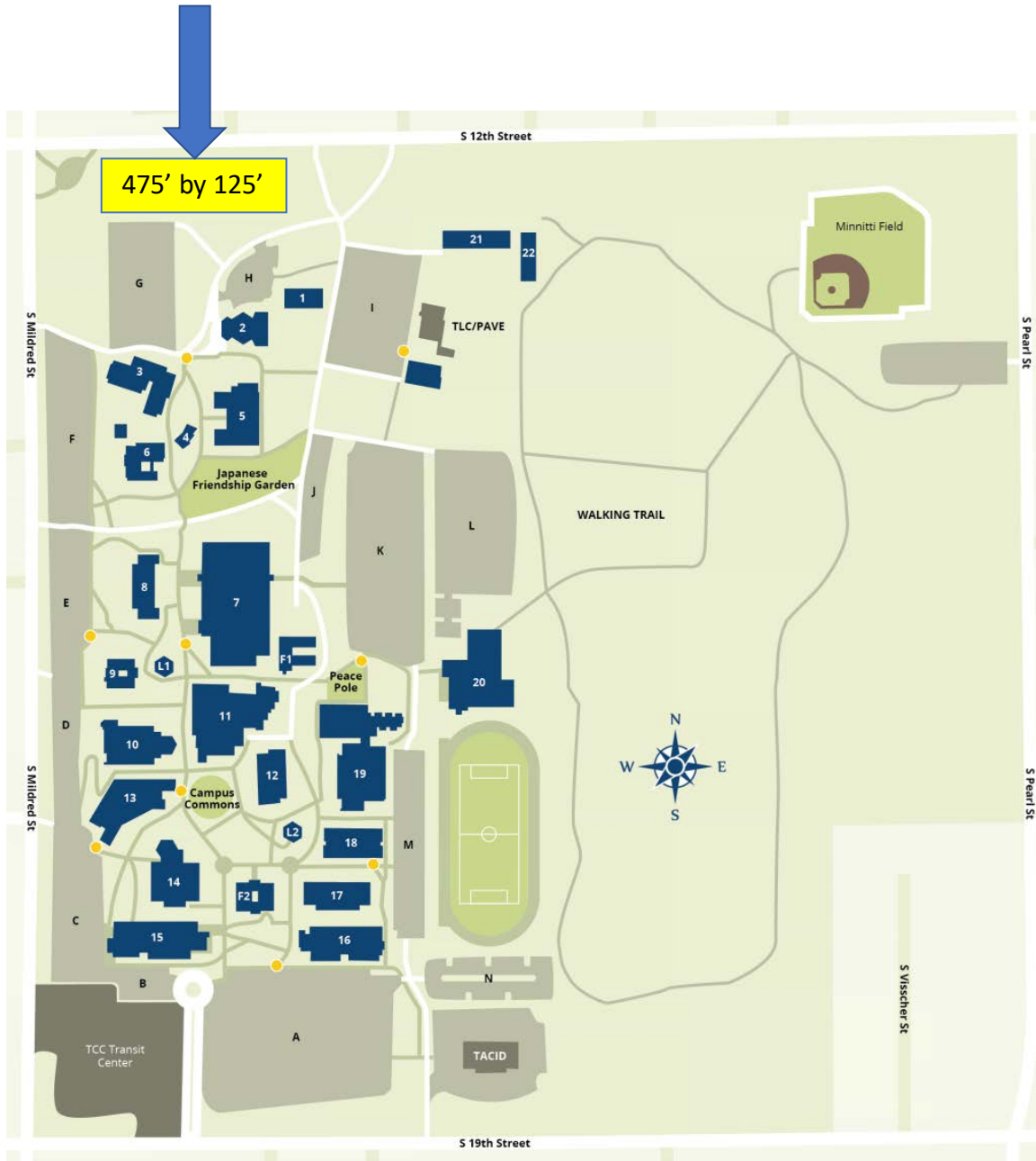
Tacoma Community College Main Campus